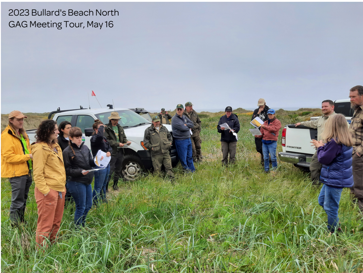
2023 Bullard's Beach North GAG Meeting Tour, May 16