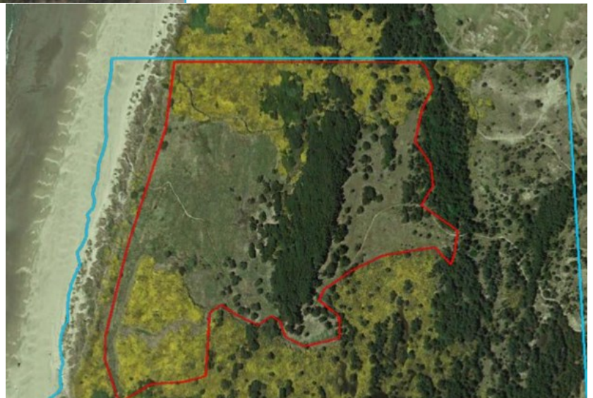
2013 gorse removal (13 acres) and dune grass planting