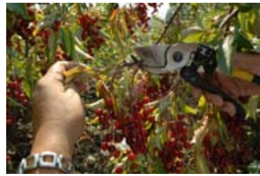
Figure 1.—The source of origin of plant material is the geographic area where the seeds or cuttings were collected originally.

Beyond deciding what species to plant, or even what plant material to use, it is important for restoration managers to consider the genetics of the plant materials they are collecting or buying. This ultimately may determine the success of the project.