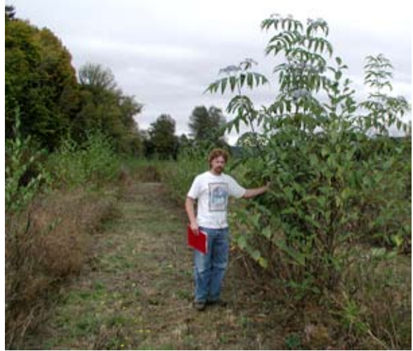
Figure 8.—Success in restoring sites has a lot to do with selecting “appropriate” plant materials; i.e., species that are suitable for the site, are grown from locally adapted sources, and have a solid genetic composition.

http://www.epa.gov/wed/pages/ecoregions/or_eco.htm