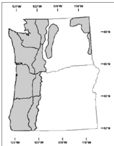
Figure 3.—Seed zone maps of Oregon and Washington for Douglas-fir (at top), which is a site specialist, and western redcedar, a site generalist.

more similar to Astoria than Roseburg) include rainfall, summer and winter temperatures, soil drainage, and soil pH.