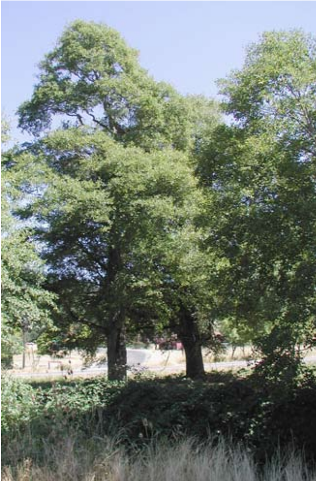
Figure 7.—White alder (above and inset at right) is a widespread species that is well adapted to riparian conditions in the Willamette Valley.

To represent a plant population well, seed or cuttings must be collected from multiple sites within the zone. Multiple parents should be sampled from each site. Seek out the larger communities, to help avoid inbreeding and meet parent-selection criteria, which are discussed on the next page.