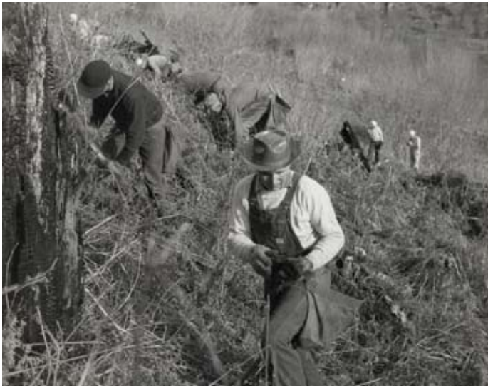
Figure 2.—Replanting the Tillamook Burn illustrated the importance of using local seed sources. Trees from more distant sources did not do as well as trees from nearer seed sources.

It would be nice if there were a consistent distance, some magic number (say, within a 50-mile radius), to indicate how far a plant might be moved successfully, but it is not that simple. For plants, “local” is best defined ecologically, in terms of climate and environment, rather than in miles. For example, the environments of Coos Bay and Astoria (200 miles apart) are much more similar than the environments of Coos Bay and Roseburg (just 50 miles apart). The conditions to which a plant species must adapt (and what make Coos Bay