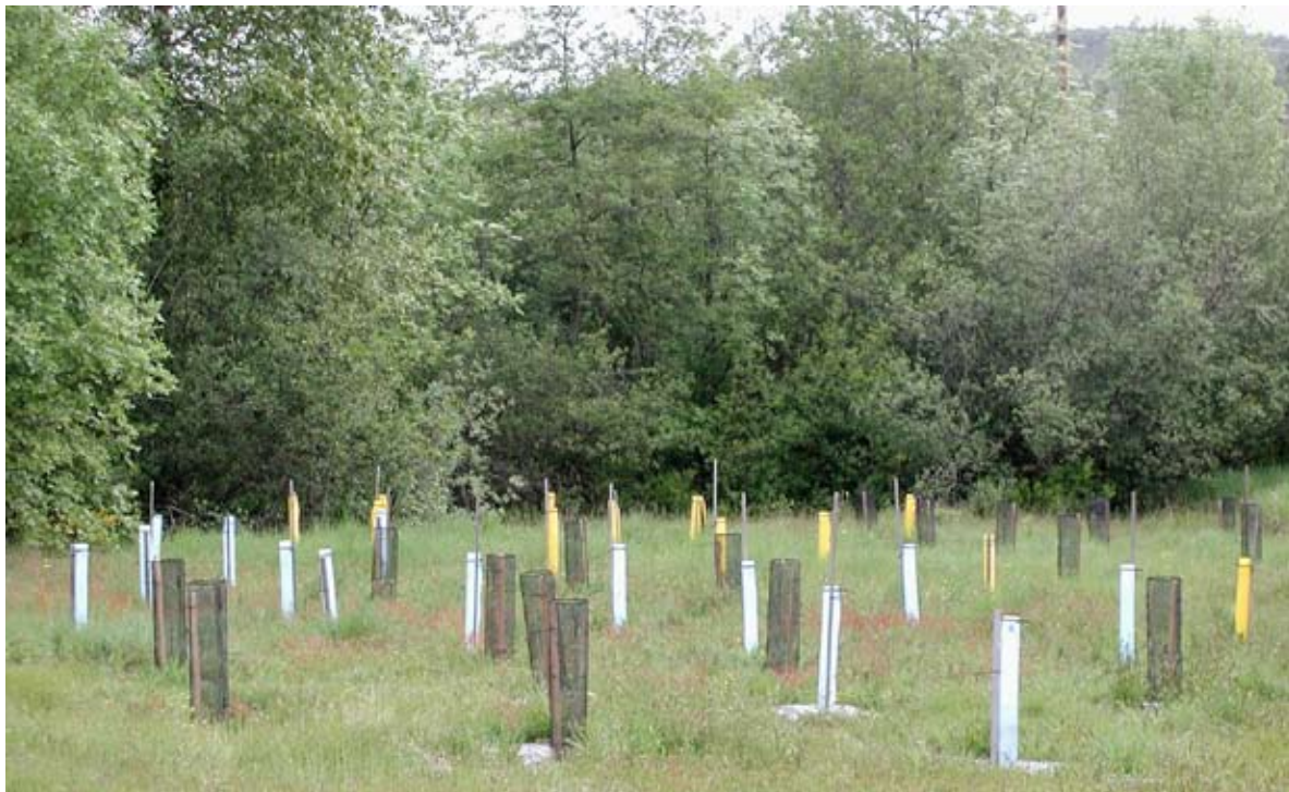
Figure 6.—In any restoration planning, it's very important to take steps that will maintain genetic variation in restored populations, both as a buffer against short- and long-term environmental changes and to reduce problems of inbreeding.

Genetic theory indicates it's best to have a minimum of 20 unrelated seed parents represented in a